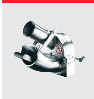
Vegetable cutter GR10