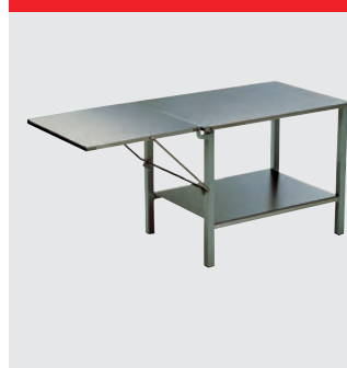
Stainless steel table for RN10