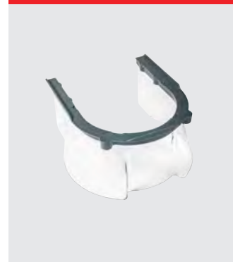
Removable magnetic safety guard. CE-certified