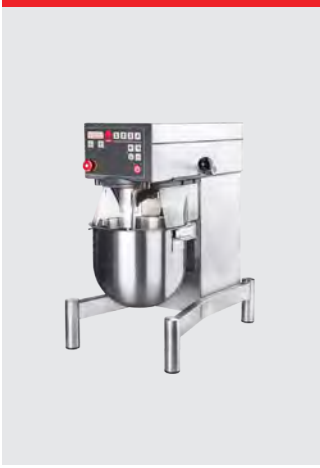
Table model, stainless steel