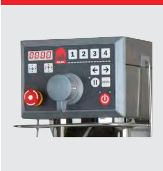
Attachment drive for meat mincer and vegetable cutter