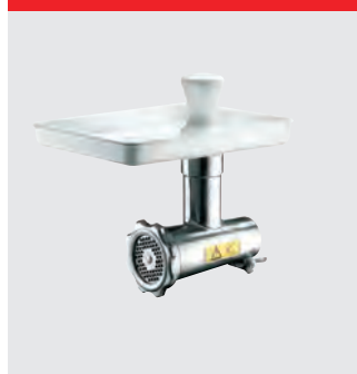
Meat mincer, 70 mm