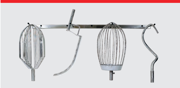
Tool rack, 91 cm