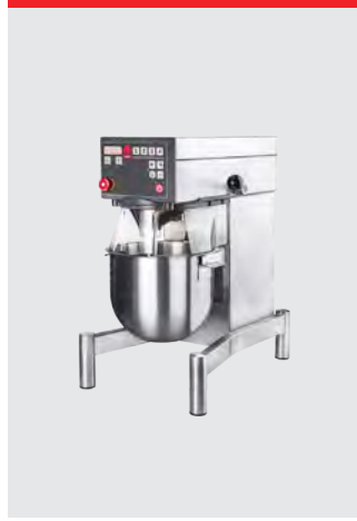
Marine version, table model