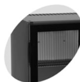
New integrated evaporator