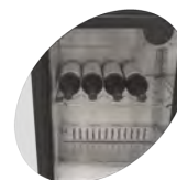
Wine shelves as option