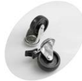
Castors with and without brake