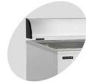
Illuminated display board as option