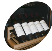
Presentation shelves available as option