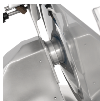
More space between blade and body machine