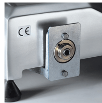
Device for releasing the carriage