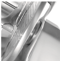
Enclosed and sealed belt pulley standard