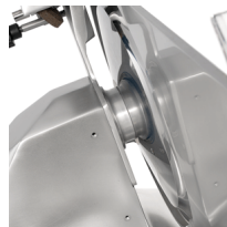
More space between blade and body machine