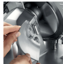
Optional: removable round slicer deflector