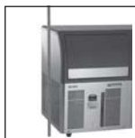
h. 798 mm with short legs