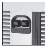
Front ON-OFF switch