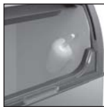
Easy bin access