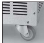
Pivoting rear wheels