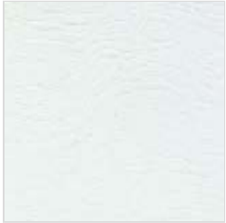
LBV Veined white