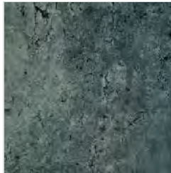
LPS Dark stone