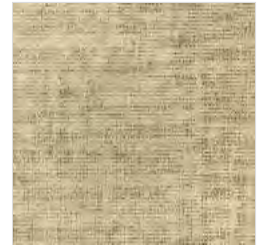
LTC Light fabric