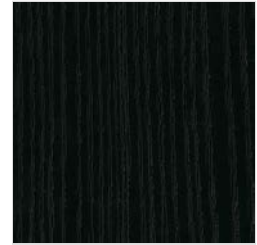
LNV Veined black