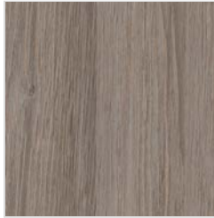
LRO Ash of roses