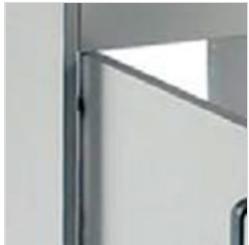
IN * con maggiorazione Stainless steel