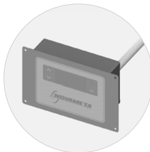
Remote control Easy-to-clean digital controller with adjustable temperature (+2 ... +8 °C)