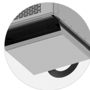
Condensate evaporator pan