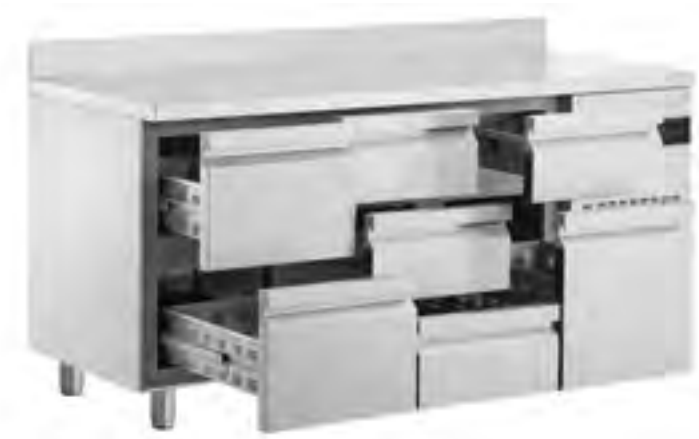
Accessories (Available separately)