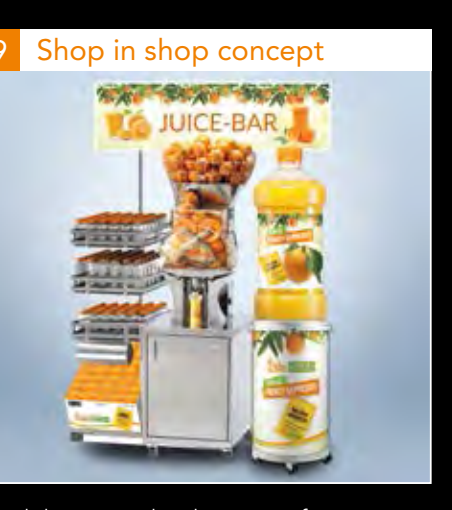
Modular juice island concept for supermarkets, shopping malls, etc.

Citrocasa offers the opportunity to equip its machines with different pressing kits ( = pressing elements + peel ejectors + knife + fruit feeding tube) for small, medi-um and large citrus fruits (50–90 mm).