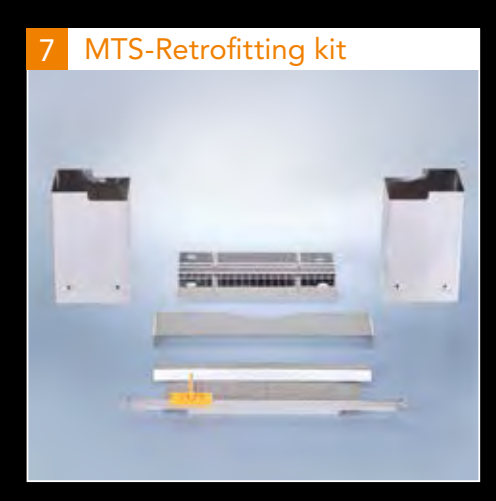
The MTS (Manual-Transport-System) keeps the sieve clean of pips and pulp without removing it. You can retrofit your normal 8000 models.