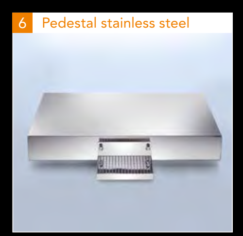
If you decide to take the Citrocasa 8000 as a tabletop-model we can provide you with a pedestal so you can comfortably place glasses and bottles below the tap.