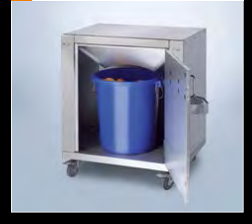
The stainless steel cabinet makes your Citrocasa 8000 into the perfect solution when you need mobility and want to exploit your juicer's pressing capacities to the fullest.