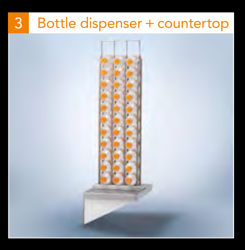
Keep your bottles handy with the optional bottle dispenser (for bottle sizes 0.25, 0.33, 0.5 and 1 liter).