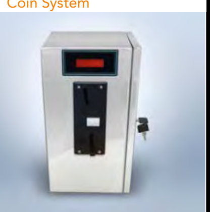
This additional device can be installed on each of our machines on request.