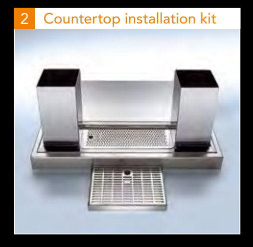
With the countertop kit you can integrate your juicer into your counter, which has to be perforated to allow the orange peel to fall into a plastic bucket placed underneath.