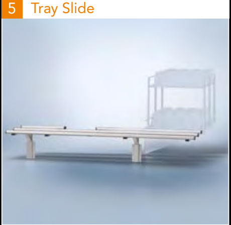
Ideal for self-service and cafeteria-style setup. 81.5 cm x 28.5 cm / 32.1 x 11.2 inches (W x D)