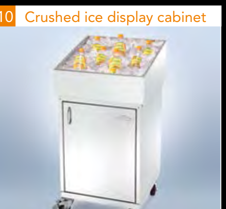
The crushed ice cabinet is an attractive option to display your pre-filled bottles and keep them cold.