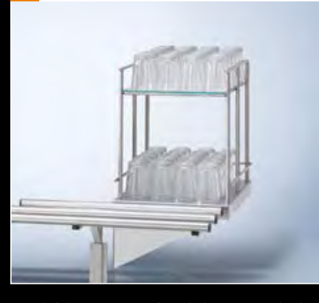
Available as 2- or 3-level design. Includes safety glass and stainless steel countertop.