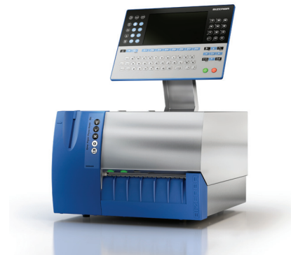
GLPmaxx in stainless steel version

Settings and maintenance of the printer unit can be made without need of any tools - reducing costs and increasing print quality. The new PC-based hardware provides more memory space and fast label data processing. By means of an USB port it is easy to run data back-ups and to buffer statistical data. The operating terminal GT-7C with color display can be operated ergonomically and thus reduces operating errors. The GLPmaxx Linerless processes Linerless labels without carrier material. As the roll contains 40% more labels, the retrofitting time is reduced for the same number of packages.