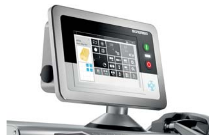
Customized touch operating panel