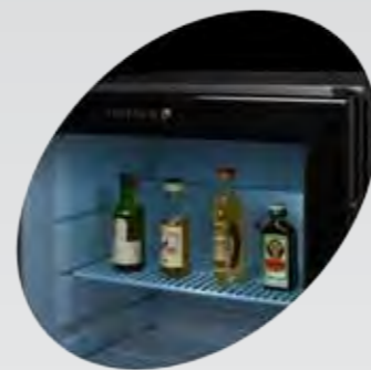
Interior LED light