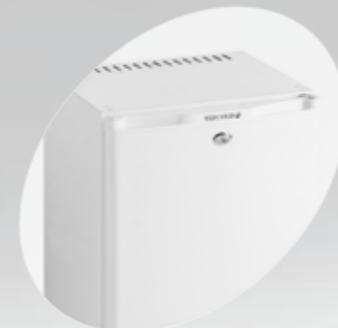
Available in white with white inner liner