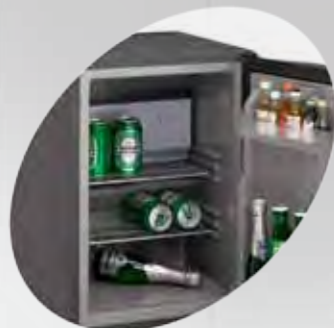
Black cabinets with grey inner liner