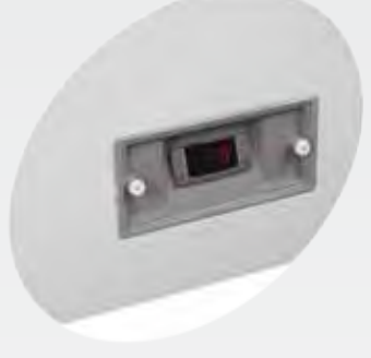
Fresh meat version available, 0 to +2 °C