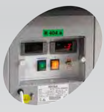
2 thermostats for switching between cooler or freezer