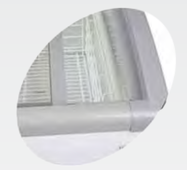
Heated frame with smooth sliding lids