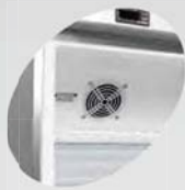
Fan assisted cooling