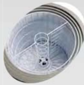
Internal fan and basket