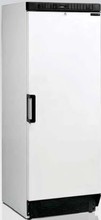
SDU1220 • Fan assisted cooling • Reversible Solid door • 3 Adjustable shelves • Adjustable feet