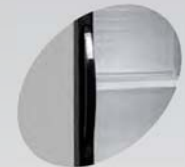
New strong handle