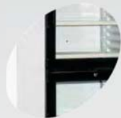
2 doors on model SCU2375