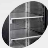
Stainless steel shelves