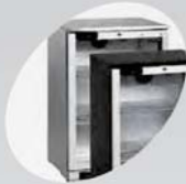
BA-ALU Models with aluminum door frames, BA-S/A Models with stainless steel body and aluminum door frame