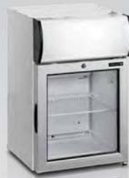
FS80CP • Illuminated Canopy • Fan assisted cooling • Glass door • 2 Fixed shelves • Adjustable feet