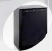
BA-HSD Models with solid doors