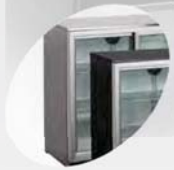
BA-ALU Models with aluminium door frames, BA-S/A Models with stainless steel body and aluminium door frame