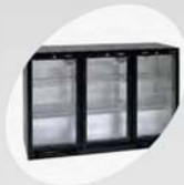
DB300H with 3 hinged doors available medio 2014