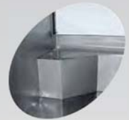
Shelf for CO2 bottle