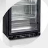
All Models available with mirror polished stainless steel interior