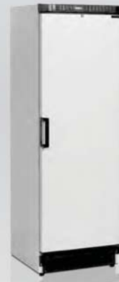
SDU1375 • Fan assisted cooling • Reversible Solid door • 5 Adjustable shelves • Adjustable feet