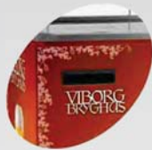
Well suited for custom decoration