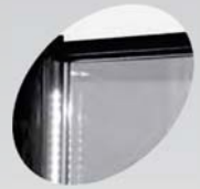
LED light in door as option