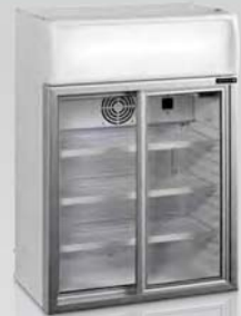
FSC100 • Illuminated Canopy • Fan assisted cooling • Self-Closing Sliding Glass door • 3 Adjustable shelves • Brackets for wall-hanging • Adjustable feet