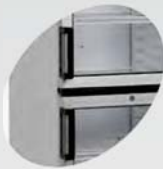
2 doors on model FS1380