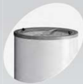
Available in white