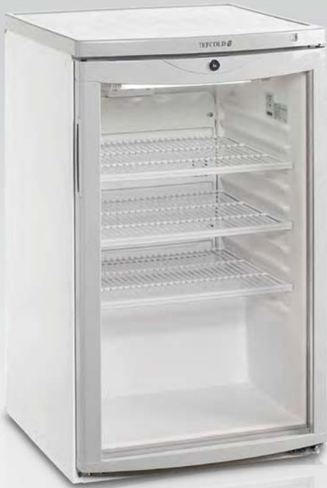
BC85 / 145