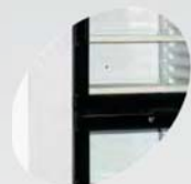
2 doors on model SCU2375CP