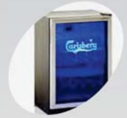
LED illuminated logo as option