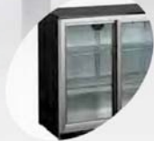
BA-ALU Models with aluminium door frames