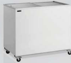
USS300SD Chest Bottle Cooler