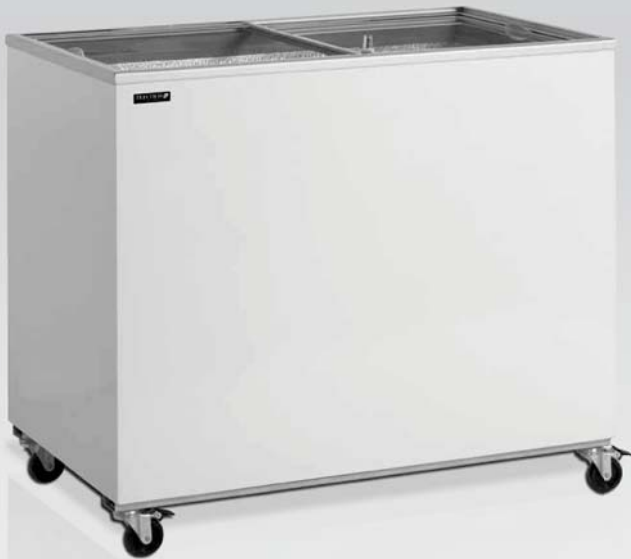
USS300YSC Chest Bottle Cooler