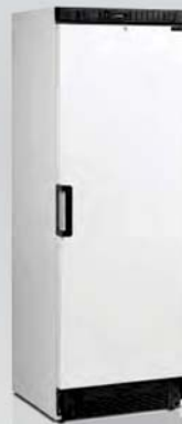
SDU1280 • Fan assisted cooling • Reversible Solid door • 4 Adjustable shelves • Adjustable feet