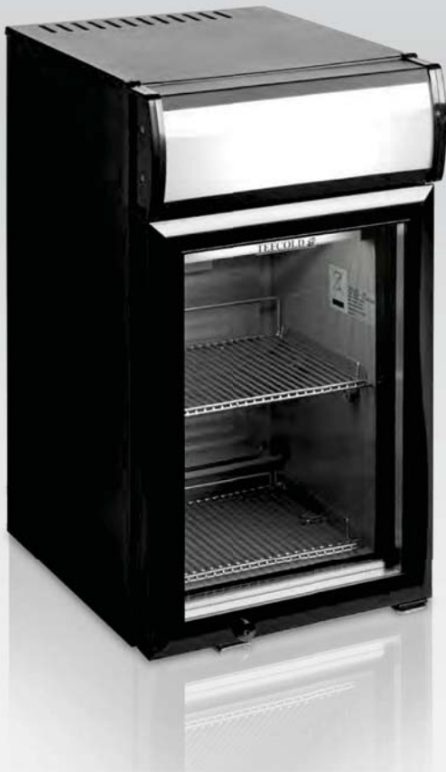
BC25CP • LED light • Fan assisted cooling • Glass door • 2 Fixed shelves • Adjustable feet