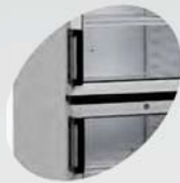
2 doors on model FSC2380