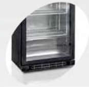
All Models available with mirror polished stainless steel interior