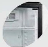
Option: LED light