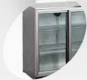
BA-S/A Models with stainless steel body and aluminum door frame