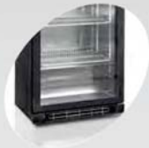
All Models available with mirror polished stainless steel interior