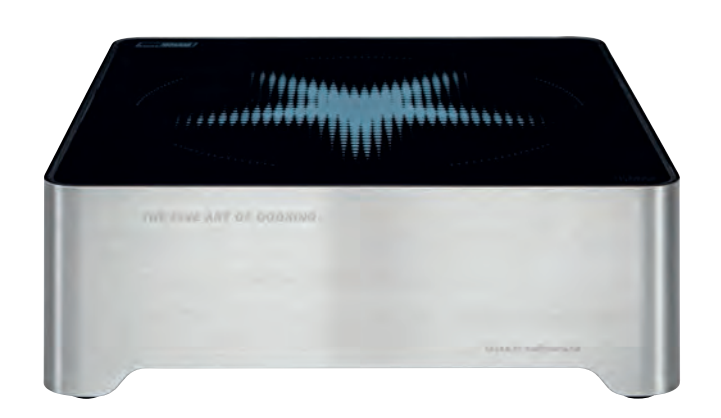
SINA - Quality at its best.

SINA is the perfect choice for effective visible cooking. SINA One, SINA Twin and SINA Wok are the only appliances in their class that feature an aesthetically designed back. They are elegant from every angle – and especially from the perspective of your guests – which makes them the ideal choice when cooking for an audience.