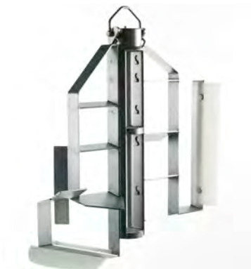
Standard mixing tool