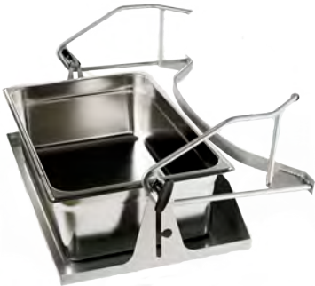
GN container rack