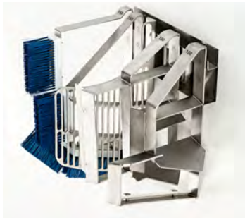
Wall-mounted tool rack