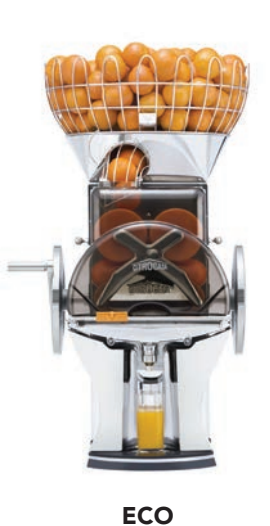
Fantastic Eco Plus