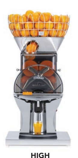
Fantastic F/D Fantastic F/SB