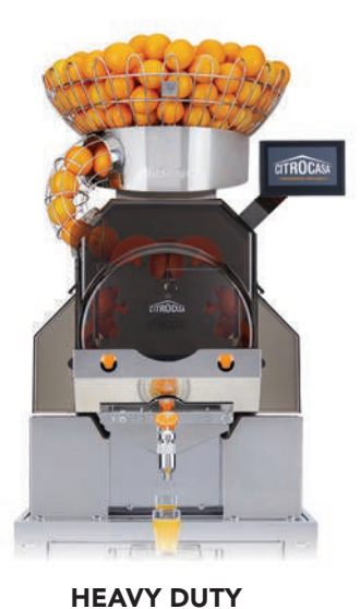
8000 XB, 8000 SB-ATS, 8000 SB-ATS Pome, 8000 eXpress, 8000 Connect