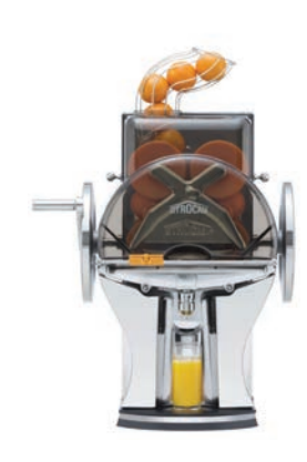
ECO Fantastic Eco Starlight