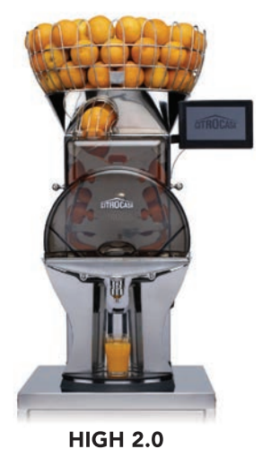
Fantastic eXpress Fantastic Connect